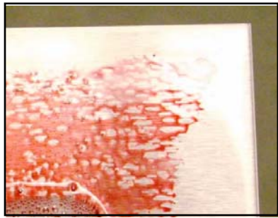
Fig. 3: Oil clumps and lifts as a result of surfactants

The combination of water, solvents, surfactants, and saponifiers can be as effective as solvent cleaning, but often requires a change in the cleaning process. In a high precision application where residues cannot be tolerated, a rinsing process is often required with water-based chemistries. Batch or in-line cleaning systems generally have rinse and dry cycles to overcome these issues.